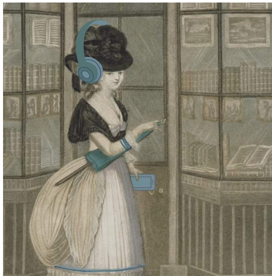
The Women's Print History Project